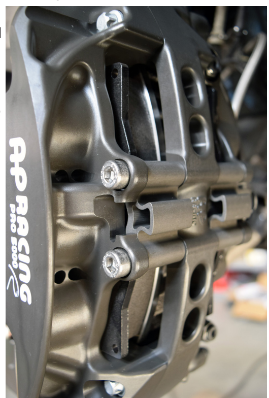
Step 12 - Repeat steps 3 thru 10 on the other side of the vehicle