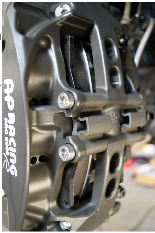
Step 13 - Repeat steps 3 thru 12 on the other side of the vehicle