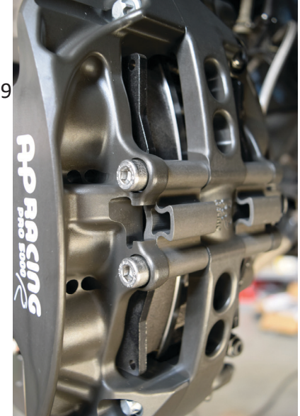
Step 12 - Repeat steps 3 thru 10 on the other side of the vehicle

• If you do not install your pads during this step, you will potentially have a big mess on your hands when you attempt to bleed your brakes!