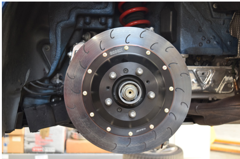
Ex: Driver side/left hand brake disc: