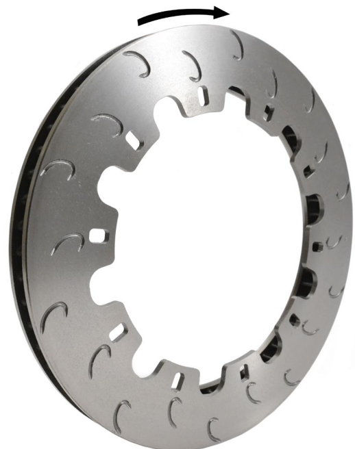
Passenger Side Disc

Ex: Passenger side/right hand brake disc: