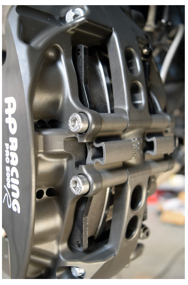
Step 12 - Repeat steps 3 thru 10 on the other side of the vehicle