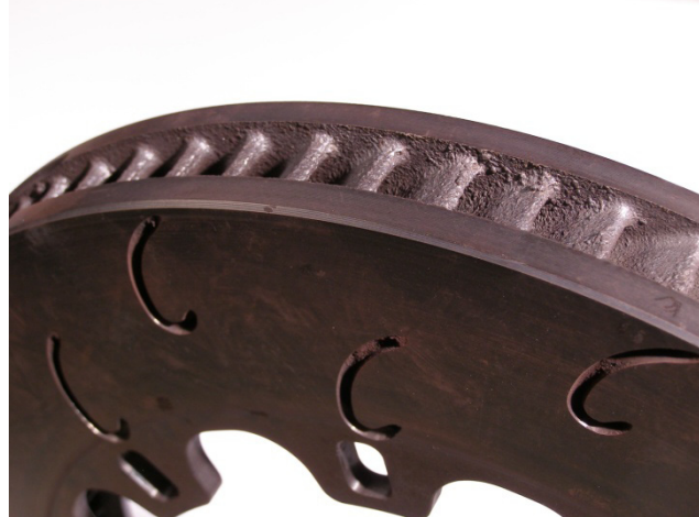
Ex: Passenger side/right hand brake disc: