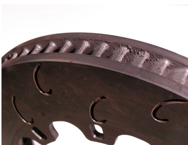
Ex: Passenger side/right hand brake disc: